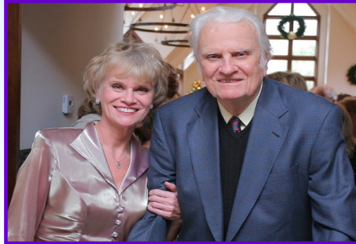
Ruth Graham and father, Rev. Billy Graham